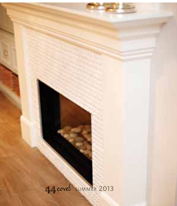
In the family room, a porcelain tile fireplace surround in a classic basket weave adds texture and quiet elegance.

The collaborative effort of everyone involved in the project - homeowners, designer and tradespeople - produced the hoped-for results: a high quality build that meets all of the homeowners'