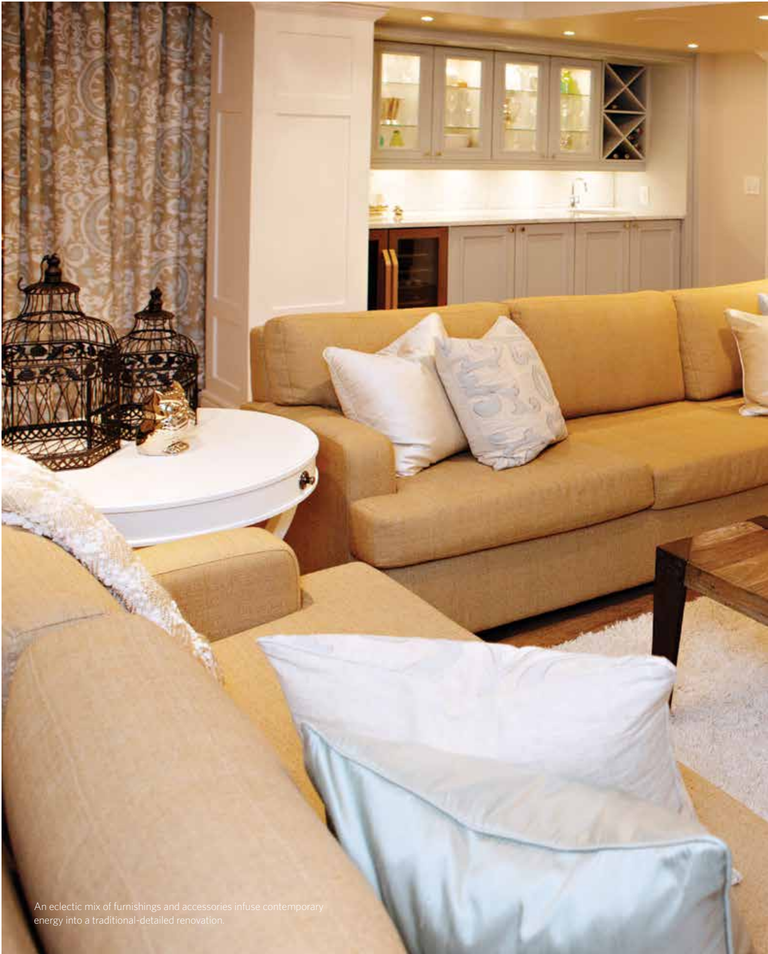
An eclectic mix of furnishings and accessories infuse contemporary energy into a traditional-detailed renovation.