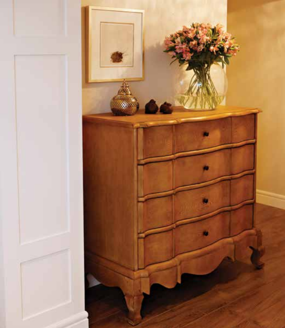
Left: A blonde wood dresser from Restoration Hardware was one of the first purchases for the space. The graceful lines compliment the linear panelling throughout the space.